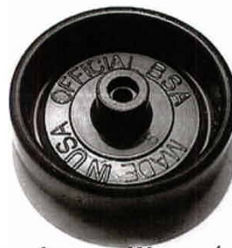
RAISED LETTER WHEEL (REAR)

Wheels will be inspected for lettering; raised lettering may not be sanded off.