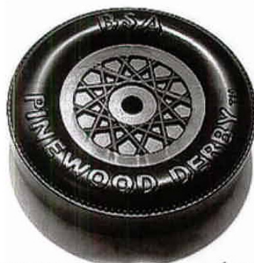
RAISED LETTER WHEEL (FRONT)

Wheels may be sanded or lathed to remove imperfections and flattened but may not be reshaped or shaved.